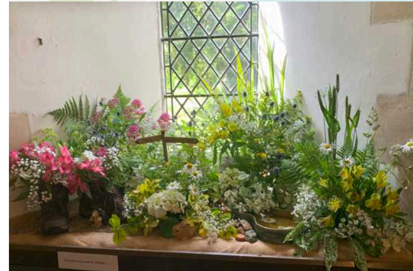
Community Flower Show