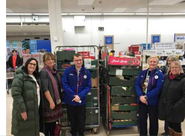
Little Larder food collection