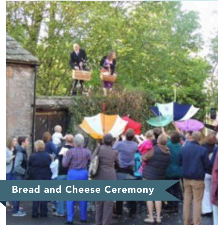
Bread and Cheese Ceremony